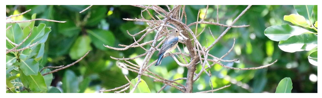
Above: Blue & White/Zappey's Flycatcher (Cyanoptila cyanomelana/cumatilis)

Sue Abbotts, Tania and I decided to do a loop of the banana plantations and with lunch approaching we made a quick stop at the supermarket. As we walked to the café, I spotted a flycatcher dart between branches in the same tree we'd staked out the day before. Awesome, BLUE & WHITE FLYCACHER and it was sitting out in the open this time. The next thirty minutes was the most hectic of the tour. We raced to the café where nearly the entire group had started lunch or at least ordered lunch. "Blue and White Flycatcher in the park near the jetty." Everyone stood up and abandoned their lunch, when James called over the radio, "I've got the Siberian Thrush near the garden gate." After a quiet and uneventful morning, we now had two megas in two different directions at the same time ...... and an empty café.