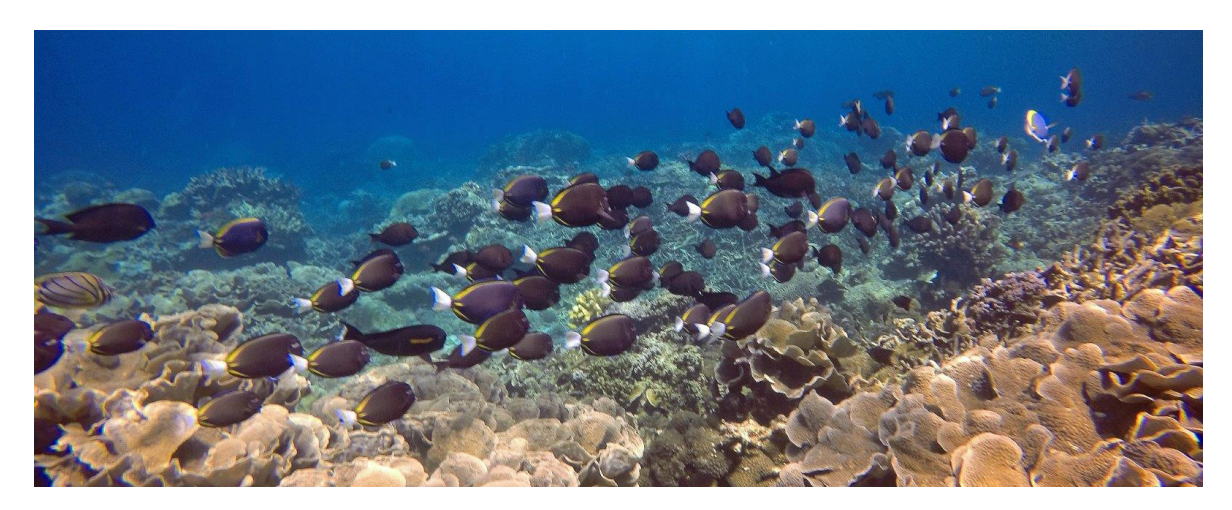
Above: Snorkelling in Flying Fish Cove

On our second last afternoon Biggles, Chris and Rosemary were driving near the detention centre when a cuckoo flushed from roadside trees in front of their car. We all drove to the site and walked the road without success. As we were just about to leave a small male goshawk flew into a nearby rainforest tree and out darted a hepatic ORIENTAL CUCKOO , which then briefly landed on a branch above the road before darting off at high speed, as Oriental Cuckoos tend to always do.