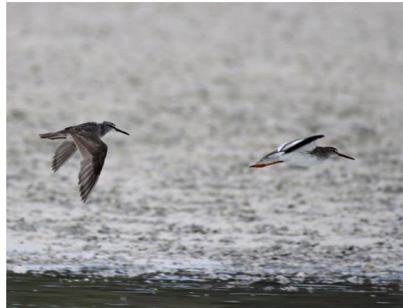
Above: Common Redshanks (Damian Baxter)

We finished off our incredibly successful week on Cocos with a nice beach BBQ on the side of the lagoon. The following day we flew to Christmas Island where a whole bunch of endemics and local specialties awaited.