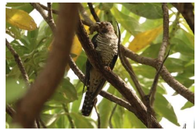
Above: Male and female Asian Koel and Oriental Cuckoo (J.Mustafa)

From the ferry we walked directly to Oceania House but luck wasn't on our side. Rob, Sue and James had seen the Sibe Thrush that morning but just ten minutes before we arrived the local gardener walked around the corner past the thrush and flushed it. We spread out and spent two hours combing the grounds seeing Asian Koel , Dollarbird and a White-tailed tropicbird , which had decided to nest in the garden and kept us entertained while we watched and waited.