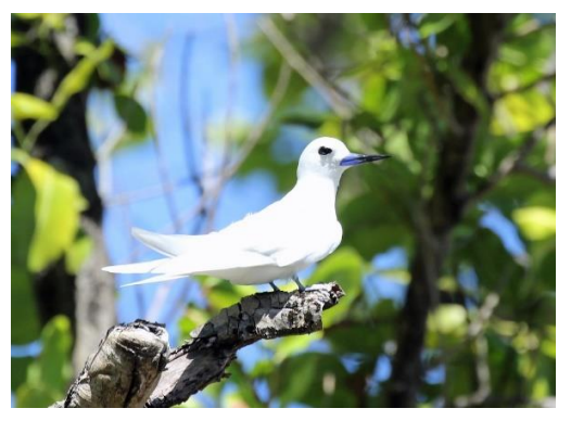
Above: Japanese Sparrowhawk carrying two baby White Terns (G.Christie) and White Tern.

Our full day on West Island proved to be productive with highlights being a CHINESE SPARROWHAWK seen in town, a PIN-TAILED SNIPE flushed from the runway verge, a piebald Western Reef Heron in the lagoon, a Javan Pond Heron at the garbage tip, two Oriental Cuckoos and four Asian Koels . Not a bad haul! More common species also seen over the weekend included Red-footed Booby (123), Brown Booby (1), Green Junglefowl (140), White-breasted Waterhen (100+), White-tailed Tropicbird (4), Greater Frigatebird (5), Lesser Frigatebird (25), Asian Intermediate Egret (7), Asian Striated Heron (2), White Tern (50) and Asian Dollarbird (1).