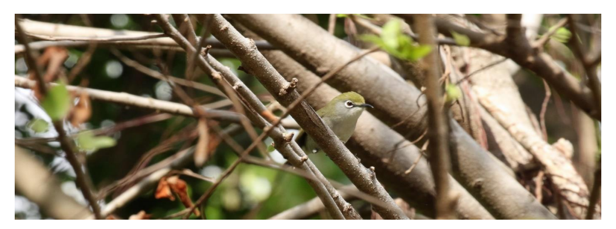
Above: Christmas Island White-eye

Our first morning was spent not too far from our accommodation in search of Java Sparrows and Asian Koel. After an hour of searching we located a flock of twenty-three JAVA SPARROW in a local yard and also had our first good views of Island Thrush, Red-footed Booby and Christmas Island Imperial Pigeon. From there we drove out to the cemetery in search of the koel which is often found feeding on wild Papaya. Scanning the nearby trees we found a nice female Christmas Frigatebird and below on the same branch was a Christmas Island White-eye, with a Christmas Island Swiftlet also flying around tree. Three new birds for most of the group in one binocular view!