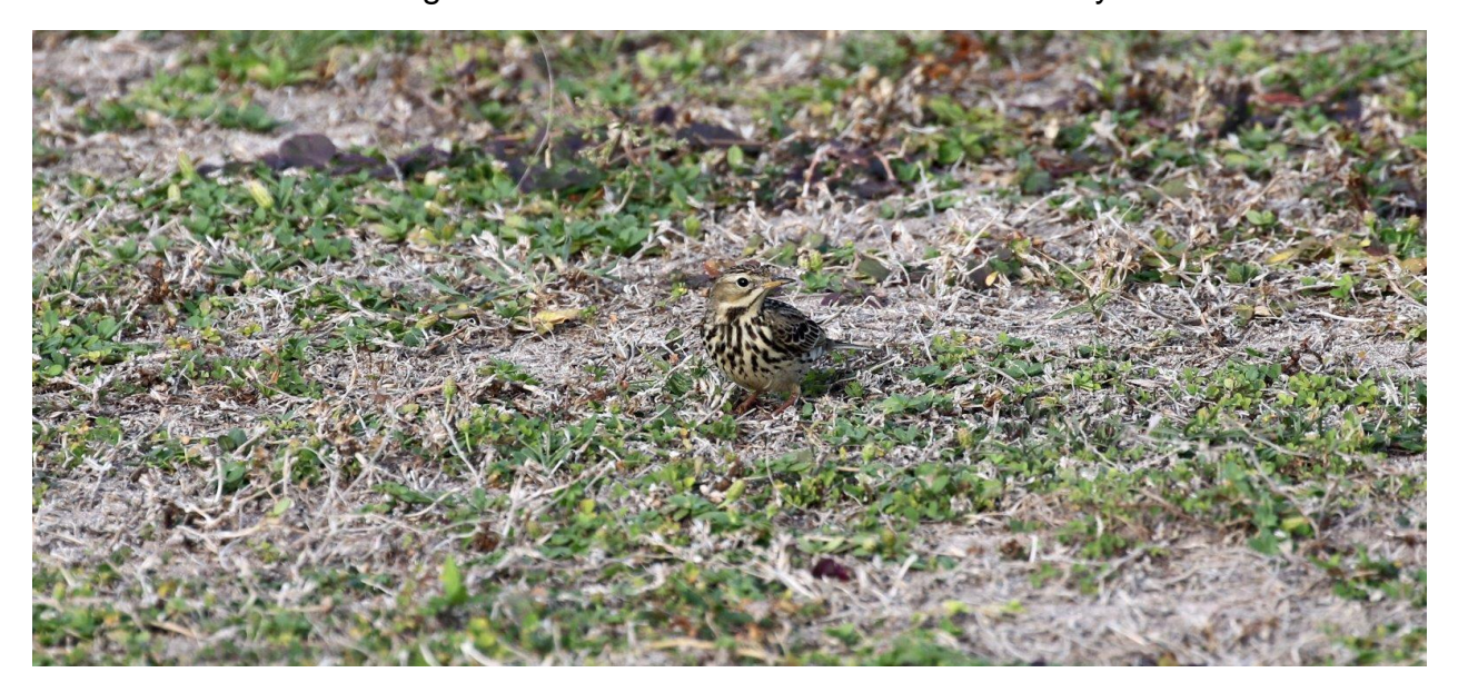
Above: Red-throated Pipit

After spending a considerable amount of time searching for Asian Koel on Christmas Island, our luck was finally changing with this species. We'd found a male ASIAN KOEL in Oceania House, followed quickly by a pair on the other side of Home Island. The following day we visited the farm on West Island where we saw another two males. While we finally had some perched views of this elusive species at the farm, word was trickling in from a few locals that a small bird had been seen on the golf course late yesterday afternoon. We drove to the 3<sup>rd</sup> hole and standing in the middle of the fairway was a cracking little RED-THROATED PIPIT . This much sort after long distance migrant proved to be very co-operative over the next few days, happily dodging golf balls and camera wielding birders as it chased insects on the fairway.