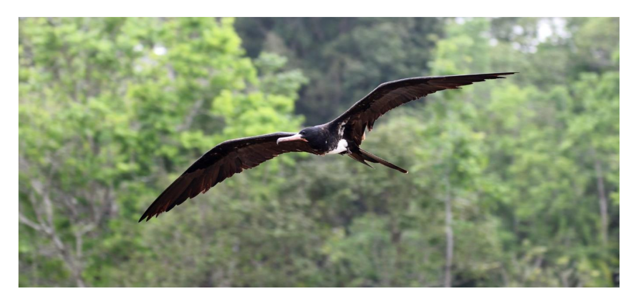
Above: Christmas Frigatebird