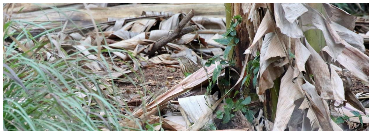
Above: Yellow Wagtail and Yellow Bittern

The following morning we walked some rainforest tracks that were closed for the Red Crab migration and had nice views of Common (Grey-capped) Emerald Dove before returning for lunch. Over the next three days we visited some of the island's grasslands, old mining sites, rainforest trails and local parks and gardens. Our afternoon visit to the Margaret Knoll lookout was fruitful, with over one hundred Abbott's Booby soaring in an updraft in front of the lookout, providing a rarely seen sight. At an unused mine site, near a large pool of water, we found six Yellow Wagtails and along the coast we located Pacific Reef Egrets , Sanderling and Pacific Golden Plover . The most frustrating event was when a small passerine with a cocked tail darted across the road in front of one of the cars near Grants Well. From the