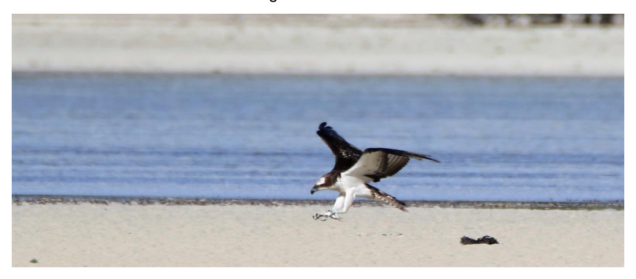
Above and Below, Western Osprey

We'd visited the end of the runway several times searching for the osprey without success. A couple of people in the group had seen it from a distance but each time we looked it wasn't there. On the third morning we decided to make it our main target and all of us drove to the end of the runway ready to spend a couple of hours waiting and searching. We stopped at the site and found the Asian race of Intermediate Egret and only after five minutes, Damian spotted the WESTERN OSPREY on a sandbank devouring a fish. We got some distant photos and slowly crept closer until it took its fish to the far end of the lagoon and out of site.