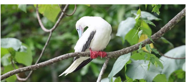
Above: Abbott's Booby and Red-footed Booby

The following morning's highlight was a flock of seven BARN SWALLOW at Flying Fish Cove. We spread out further afield and soon after Tania discovered a non-breeding EASTERN YELLOW WAGTAIL near South Point Temple. We followed up the sighting and after a five minute wait on the veranda the wagtail flew in to a small