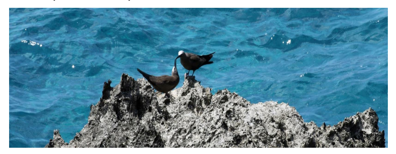
Above: Common Noddy

Over the next few days we continued to explore the island finding Lesser Frigatebird which was an unusual find with only a few breeding pairs on the island. Common Noddy was abundant around the cliff edges and common on the phosphate loader with daily counts of up to 250 roosting around the cove. Red Junglefowl was seen at various spots around the island in small numbers, as was the Asian race of Intermediate Egret. Along the forest trails and sometimes around settlement we found the local race of Brown Goshawk and after some rain two Pacific Swift circled the runway area for two days.