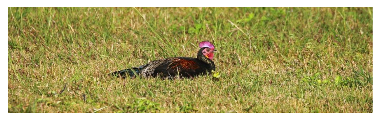
Above: Green Junglefowl

Our first afternoon was spent visiting the local wetlands and doing a familiarisation drive around West Island for the first timers to the island. Our group was about 50/50 first time visitors and repeat visitors, a few of which were on their 5-10<sup>th</sup> trip.