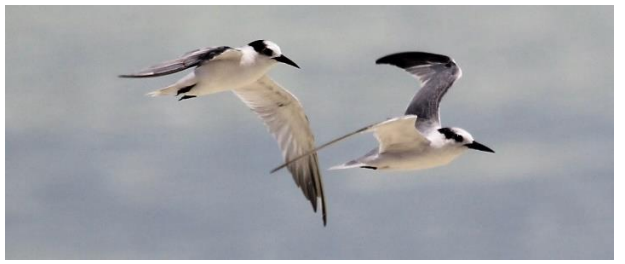
Above: Blue Rock Thrush (James Mustafa) Above: Saunders's Tern (Jim Sneddon)

The ferry doesn't run to Home Island on Sundays so we spent the next day on West Island. Rik from Cocos Tourism had photographed a Japanese Sparrowhawk eating a young White Tern in a tree in his back yard only the morning before. We staked out the area but failed to see anything. Geof Christie had more luck further along the island and photographed a JAPANESE SPARROWHAWK carrying two young White Terns into the palm forest. The sparrowhawk proved elusive all week and it wasn't until the last couple of days that a couple of members of the group got views of the bird. When we arrived there were nine white tern chicks in the trees at the back of the houses near Geof's place. By the end of the week they were all gone.