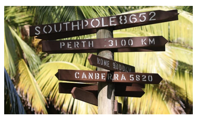
Above: 3100km to Perth

Often the terns are obliging and allow as to approach quite close but this time, after a few steps they alighted and were not seen again. We continued to scan the area and found a nice suite of waders, which included Terek Sandpiper , Grey Plover and Sanderling. We finished our time on South Island with some snacks, a few drinks and a swim in the lagoon.