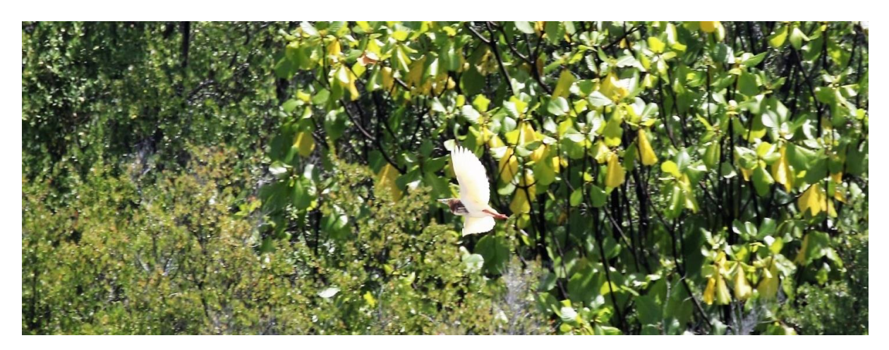
Above: Chinese Pond Heron South Island Cocos

After spending a considerable amount of time searching for Asian Koel on Christmas Island, our luck was finally changing with this species. We'd found a male ASIAN KOEL in Oceania House, followed quickly by a pair on the other side of Home Island. The following day we visited the farm on West Island where we saw another two males. While we finally had some perched views of this elusive species at the farm, word was trickling in from a few locals that a small bird had been seen on the golf course late yesterday afternoon. We drove to the 3<sup>rd</sup> hole and standing in the middle of the fairway was a cracking little RED-THROATED PIPIT . This much sort after long distance migrant proved to be very co-operative over the next few days, happily dodging golf balls and camera wielding birders as it chased insects on the fairway.