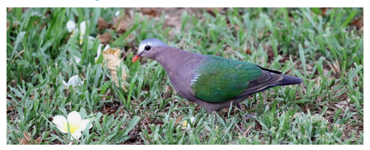
Above: Common Emerald Dove

Christmas Island has a good mix of endemics and local specialties. The local specialties are species that are found elsewhere in the World and even elsewhere in Australia and are easily seen on Christmas Island. For example Common Emerald Dove is found throughout most of South East Asia and is replaced by Pacific Emerald Dove in Australia. Island Thrush is found in parts of Asia, PNG and the Solomon Islands and the Christmas ssp has now been given full species status. Christmas Island is the only location in Australia where these species can be seen and we'd seen both species within 300m of our accommodation on the first afternoon.