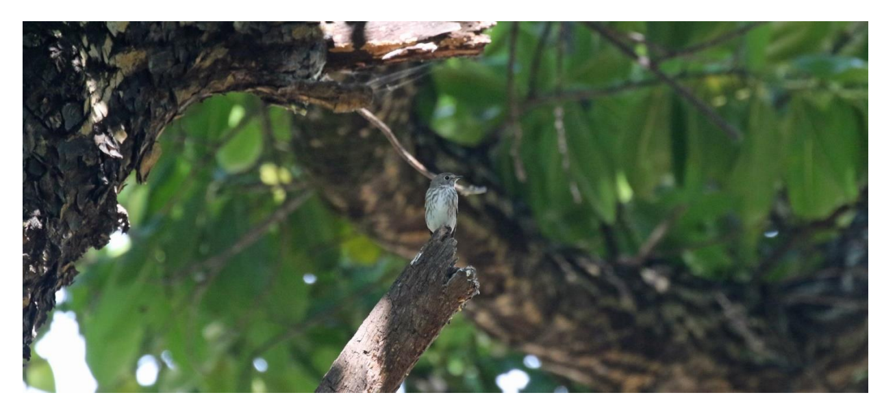
Above: Grey-streaked Flycatcher

Our walk to the pond heron site was successful and before long the entire group had had nice views of a partial breeding plumaged CHINESE POND HERON . It certainly wasn't cooperative and we had to position ourselves behind some palm fronds and wait for twenty minutes but in that time it returned to its original location twice. It was on a Birding Tours Australia trip to Cocos in 2006 that we found Australia's first ever identifiable pond heron and now a decade later we're seeing both species in a fortnight, on the same tour!