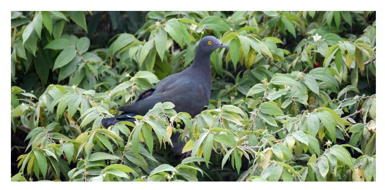
Above: Christmas Island Imperial Pigeon

the shots they needed. Eurasian Tree Sparrow was seen daily around settlement, as were the local race of Brown Goshawk and Nankeen Kestrel .