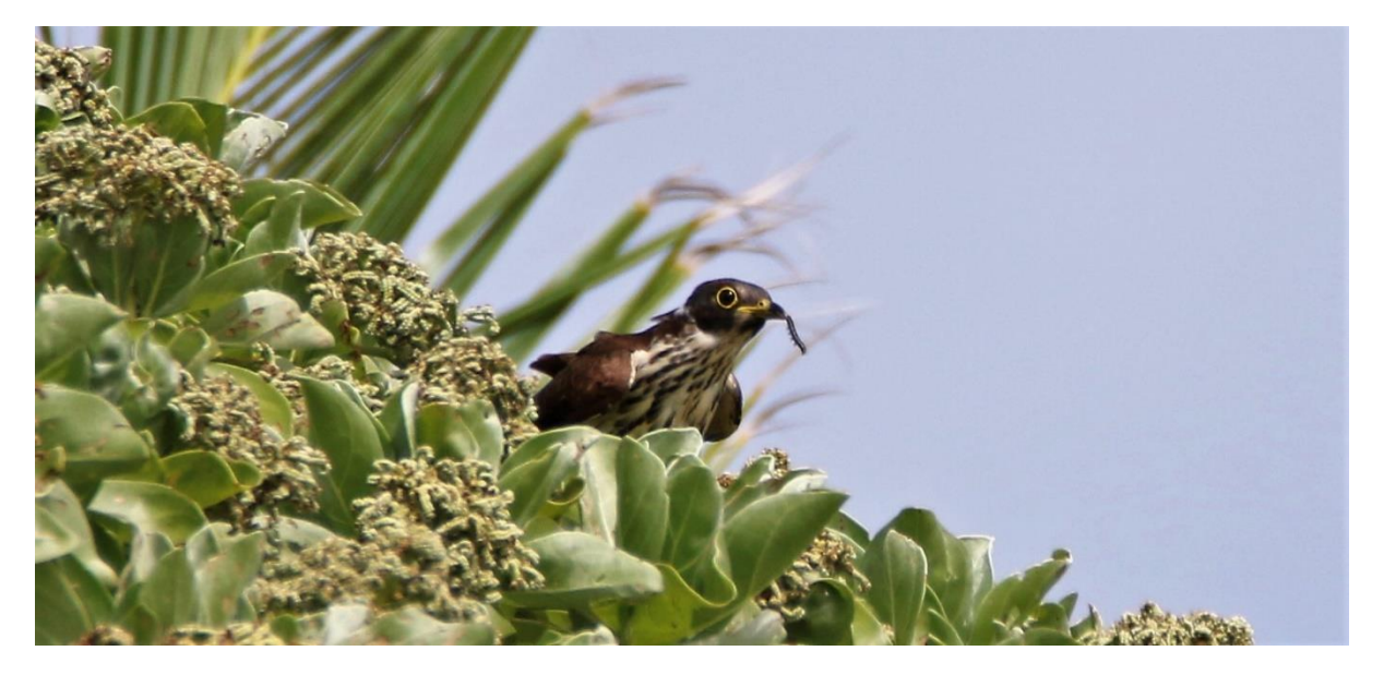
Above: Hogdson's Hawk Cuckoo (D.Baxter)

In December we searched long and hard for Hodgson's Hawk Cuckoo. We spent well over twelve hours staking out its flight path and even then a couple of people still missed it. January couldn't have been any different. The cuckoo had moved into smaller bushes to feed on caterpillars and the group simply walked up to the bushes and obligingly the HODGSON'S HAWK CUCKOO flew around and landed on the top of a bush for all to see.