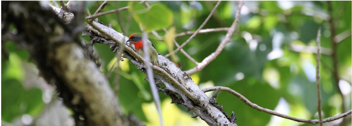
Red-capped Flowerpecker (R.Baxter)

With time spare before lunch we found a shady spot with plenty of good perch trees nearby and played a few calls of species found in nearby coastal PNG. We started with Rufous-bellied Kookaburra with no response, followed by Mimic Honeyeater. As I played the call, Scott yelled out, "I've got a Lewin's type honeyeater over hear." We all rushed over to see it move to the back of the tree and depart through the forest. Incredibly the plan had worked, Australia's first MIMIC HONEYEATER! We searched for another ten minutes without success and went back to playing a few calls of species like Golden Monarch and Yellow-bellied Gerygone. The only bird to investigate was Leaden Flycatcher and it was soon time to head back to the boat for lunch. We decided to play the mimic call once again and instantly it darted into the tree in front of us from deeper in the forest. It departed as quickly as it arrived and some of the group had better views than they had with the earlier sighting. Disappointingly, no one was able to get a photo.