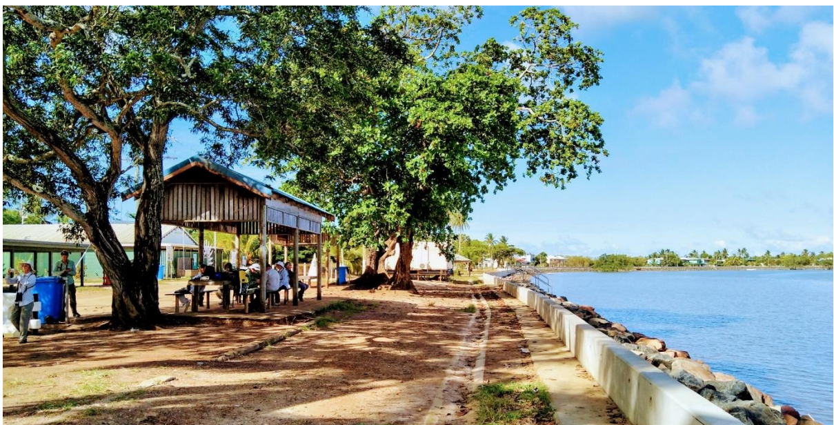
Above: Saibai Island Water front. (R.Baxter)

With two of the four local specialties seen and two rarities on the trip list we headed for Saibai in search of Coconut Lorikeet and the flowerpecker. Our first morning was spent near the cemetery where we spent a couple of busy hours watching Dusky Honeyeaters, Papuan Drongo, Red-headed Honeyeater, Orange-footed Scrubfowl, Northern Fantail, Shining Flycatchers and Varied Trillers