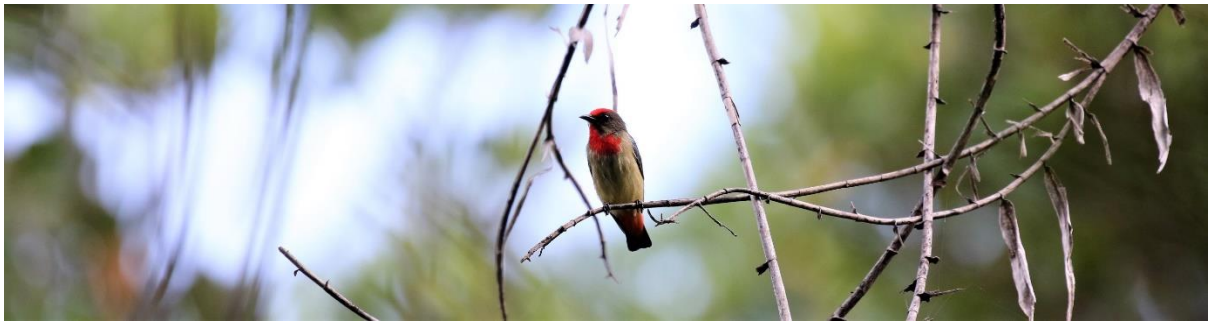
Above: Red-capped Flowerpecker

The final trip of 2018 started on a windy morning at Horn Island, adjacent to Thursday Island, the administrative centre of the Torres Strait. We decided to leave the visit to Little Tuesday Island for Ashy-bellied White-eye until the return trip when calm weather was forecast. Twelve hours later we motored into our mooring at Boigu Island and prepared for the week of birding ahead.