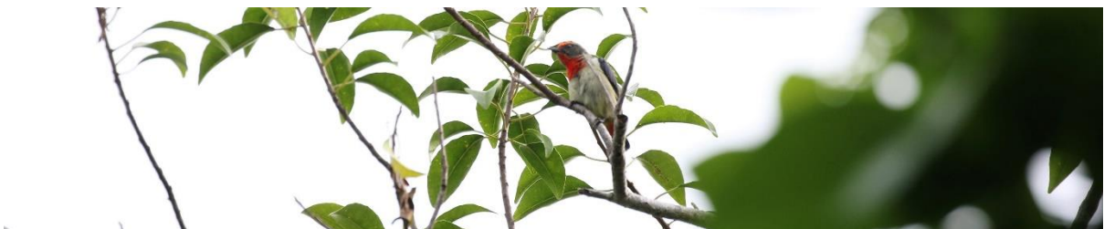
Above: Red-capped Flowerpecker (R.Baxter)

After a late breakfast we returned to the island and tried unsuccessfully for Mimic Honeyeater. Graham was the only person who hadn't seen the flowerpecker previously so we both went in search of it while the others checked out an area of nearby forest. Half an hour went by with no sign of our target but just as we had picked up our backpacks and prepared to leave, Graham caught a flash of red in the foliage and was onto a cracking male Red-capped Flowerpecker mid-level in the tree directly in front of us. Success, we had three of the four local specialties before lunch on day one.