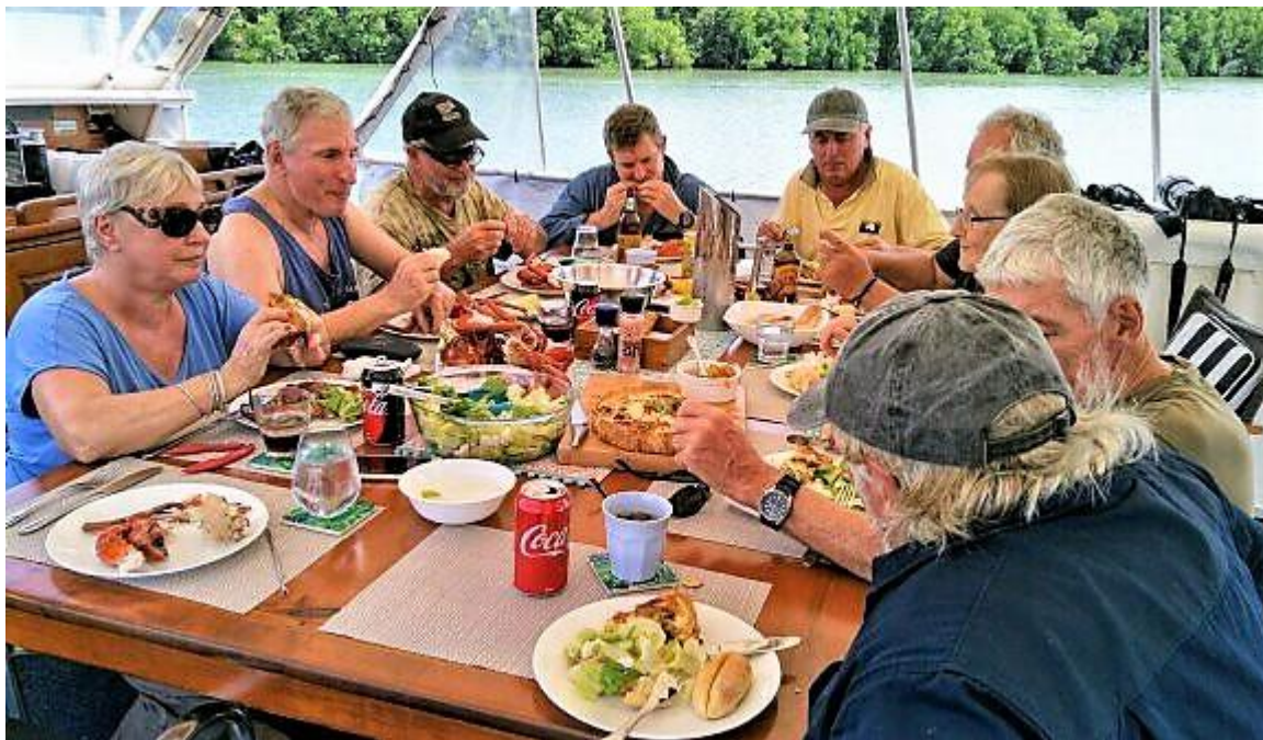
Above: Mud crab lunch