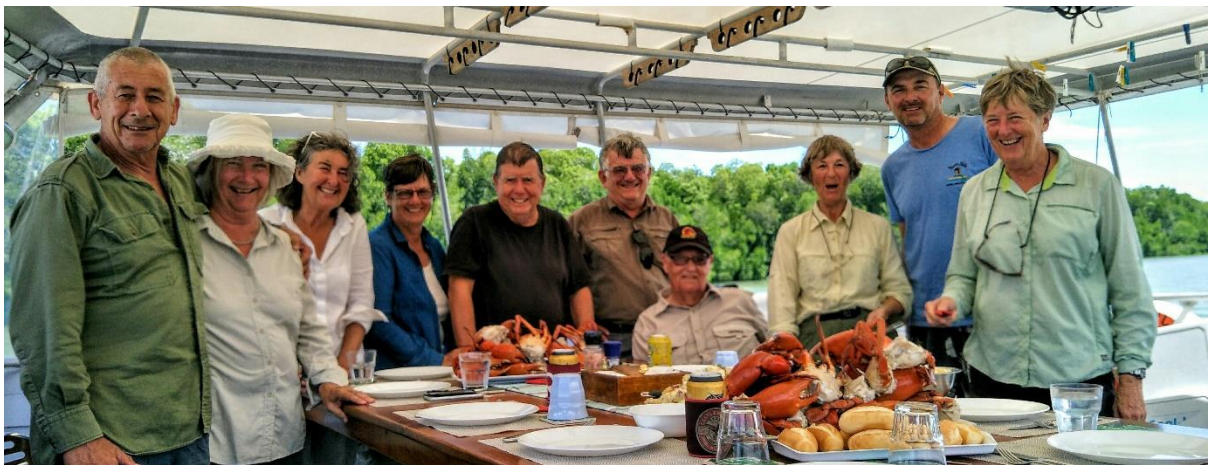
Above: Group photo. Mud Crab lunch on the top deck.

After purchasing a few Mud Crab off the locals we moved to the far side of the island in search of our next two targets.