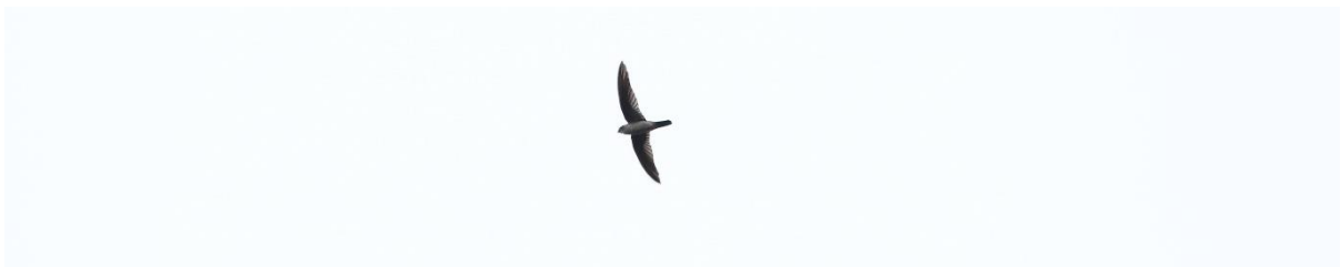
Above: Uniform Swiftlet (John Stirling)

Walking to the site we noticed a few Pacific Swifts flying overhead and we began scanning the skies for something different. It wasn't long and the first UNIFORM SWIFTLET cruised overhead, followed by a couple more.