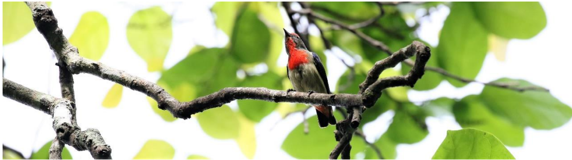
Above: Red-capped Flowerpecker (R.Baxter)

Most of the group needed better photos of the flowerpecker after seeing it on Boigu in overcast and showery weather, so we went into the forest in search of the smallest of the local specialties. As we walked to the site, Tawny-breasted, Varied, Dusky, Brown and Rufous-banded Honeyeaters were common, as were Spangled Drongo, Large-billed and Mangrove Gerygone ssp pallida . We arrived at the flowerpecker site and soon had a spectacular male Red-capped Flowerpecker showing well for us all and providing some nice photographic opportunities.