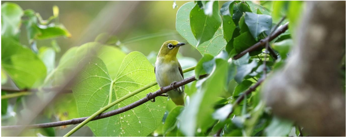
Above: Ashy-bellied White-eye

Our first morning on Boigu was a cracking success. We landed in the pre-dawn light and made our way through town to the forest edge where we watched and waited. Our first sighting was a flock of thirty Torresian Imperial-pigeon, followed by Cicadabird and Varied Honeyeater. After a while, two Pacific Swifts approached from the west and passed overhead. We soon had six Pacific Swifts and three HOUSE SWIFT . These were later joined by a lone PACIFIC SWALLOW and a dozen White-throated Needletail.