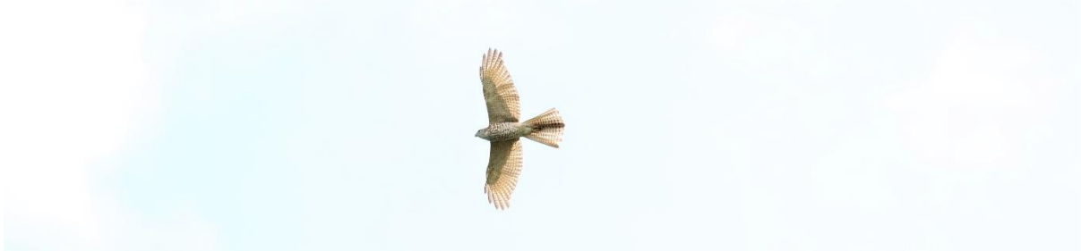
Above: dogwa ssp of Brown Goshawk (R.Baxter)

We spent a productive two full days on Saibai Island exploring the coastal forest and local waterways. We quickly added several new species to the trip list and continued to see good numbers of Collared Imperial-pigeons , giving the trip's photographers opportunity to get that perfect shot. A morning session near town produced Orange-footed Scrubfowl ssp reinwardt, Eclectus Parrot, Pacific Koel, Torresian Kingfisher as well as the small local Southern PNG dogwa ssp of Brown Goshawk.