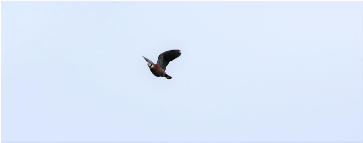
Above: Collared Imperial-pigeon