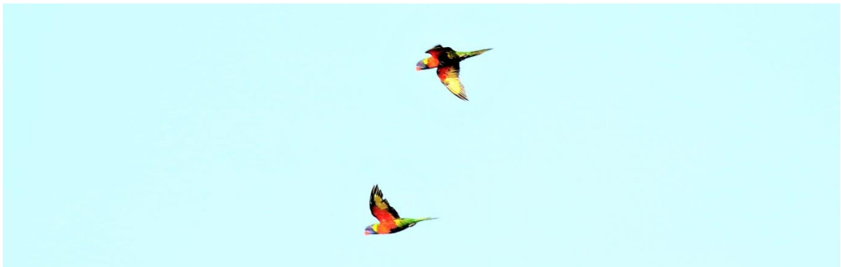
Above: Coconut Lorikeet

As we prepared for the boat trip we were all gearing up at the back of the boat when the call went out, "lorikeets !" Directly behind the boat, crossing the channel were two Coconut Lorikeets , the first we'd seen in two weeks. Two people didn't see them so we continued our search.