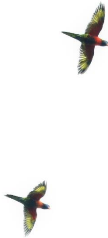
Coconut Lorikeet (John Stirling)

An early start on the island and we staked out a site on the western end of the island that had been good to us in the past. The birding was productive and enjoyable with a constant flow of species through the coastal trees and passing overhead. Our morning began with several Channel-billed Cuckoo and White-throated Needletail migrating north. Flocks of Torresian Imperial-pigeons flew along the coastline while Collared Imperial-pigeons crossed back and forth over our heads. A flock of noisy Metallic Starling passed by and the resident Osprey flew back and forth carrying nesting material. Undoubtedly, the best bird of the morning were several COCONUT LORIKEETS , the last of the local specialties, which screeched noisily overhead.