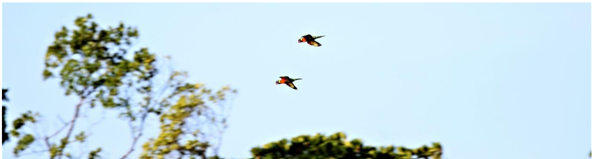
Above: Coconut Lorikeets (R.Baxter)

While watching for eagles required scanning the skies in all directions, waiting for lorikeets to appear was a somewhat easier task. We lazed around the boat and listened for the lorikeet flight call. It didn't take long but only happened once. Mid afternoon someone heard the well known distinctive call and yelled, "lorikeets". We jumped up to see two Coconut Lorikeets fly across the channel in front of the boat. The last of the local Northern Torres Strait specialty birds.