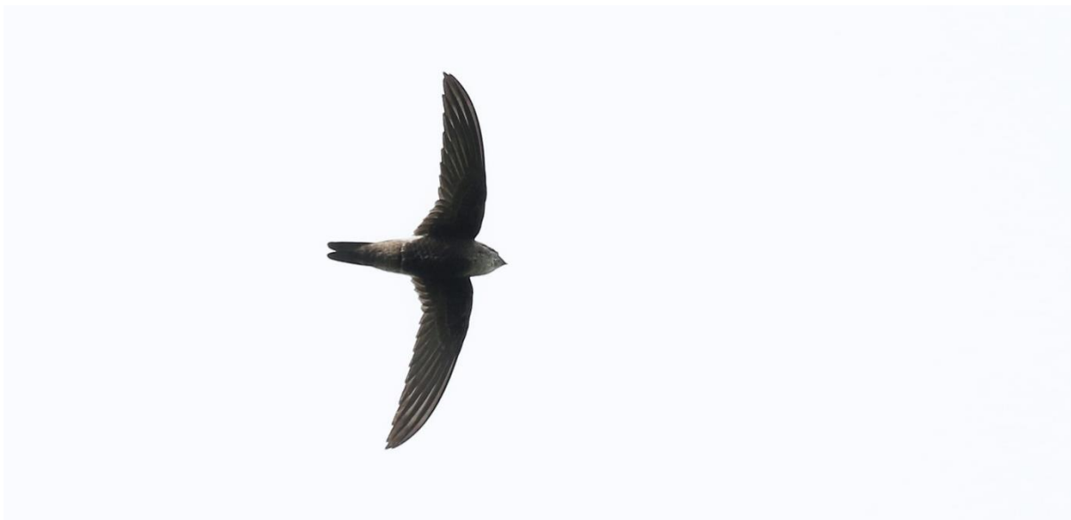
Above: House Swift

The next morning we went ashore before dawn to chase up a nightjar sighting. We walked to the site in the pre-dawn and located a Large-tailed Nightjar close to the island's runway. Our next target was the flowerpecker but first we staked out some nearby trees while we waited for better light. While we waited we witnessed the remarkable sight of waves of Uniform Swiftlets coming down the coast and over our heads. By the time we had left we'd seen an extraordinary seventy-six Uniform Swiftlets , a single House Swift , two Pacific Swifts and four White-throated Needletail.