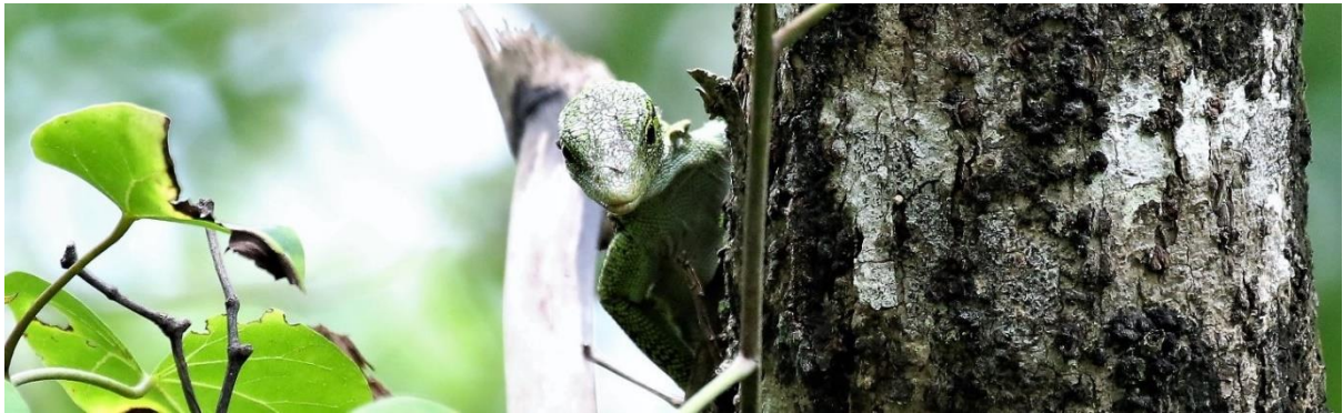
Above: Emerald Monitor

Everyone on trip three had previously seen the white-eye so we headed straight to Boigu Island. Our first morning was spent ashore where we had our first Collared Imperial-pigeons and Singing Starlings . Migrating Dollarbirds, Rufous Fantails, Pacific Swifts and Channel-billed Cuckoos kept us busy, while a few Uniform Swiftlets finished off the morning nicely.