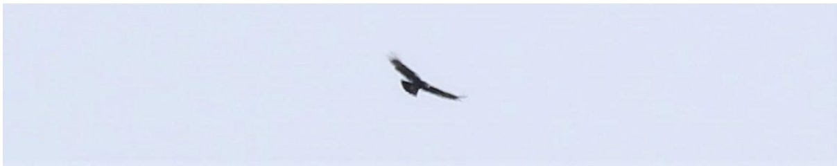
Above: Gurney's Eagle (R.Baxter)

We positioned Eclipse an hour away from town, in the heart of Gurney's Eagle territory and waited for it to cruise past on the late morning thermals. It was first spotted soaring a kilometre away behind the boat so we jumped in the zodiacs and headed east along the channel for better views. We spent the next twenty minutes watching a lone Gurney's Eagle soaring over the island. The following day we saw it again at roughly the same time.