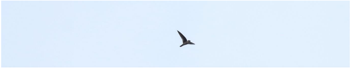
Above: Uniform Swiftlets (R.Baxter)

Our targets for the next two days were Coconut Lorikeet and Gurney's Eagle. It didn't take long to spot a large black eagle with broad bulging secondaries soaring behind the boat. An hour later two Gurney's Eagles were spotted soaring together, which was the first time more than one bird had been recorded.