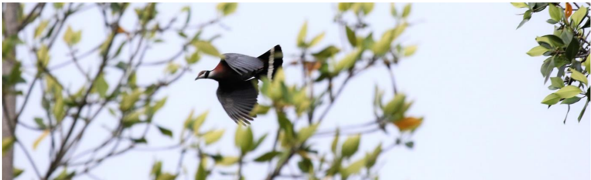
Above: Collared Imperial Pigeon (Richard Baxter)

The first of the local specialties arrived half an hour later when a SINGING STARLING perched on an exposed branch in front of the group. The second followed quickly, when a lone COLLARED IMPERIAL PIGEON , cruised overhead, allowing a few photos to be taken before disappearing into the riparian forest. What a morning, what a start to the first day on the islands! Happy with our outing, we returned to the boat where our on-board chef prepared us a hot breakfast.