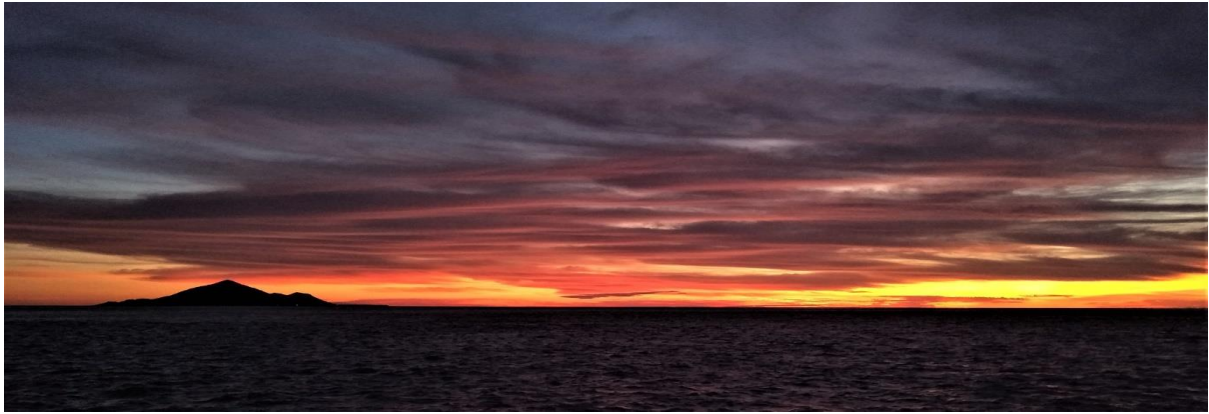
Above: Sunset on our final night at Saibai

At 9.30am the next morning we stepped into the dinghy for the last time and made the short trip to the sandy beach on the western side of the island. Once ashore we tracked down 5-6 Ashy-bellied White-eye in the vine thicket and after half an hour on the island returned to Eclipse for our final lunch. Sadly it was time to say goodbye at the airport to catch the departure flights home. Thank you for an awesome trip.