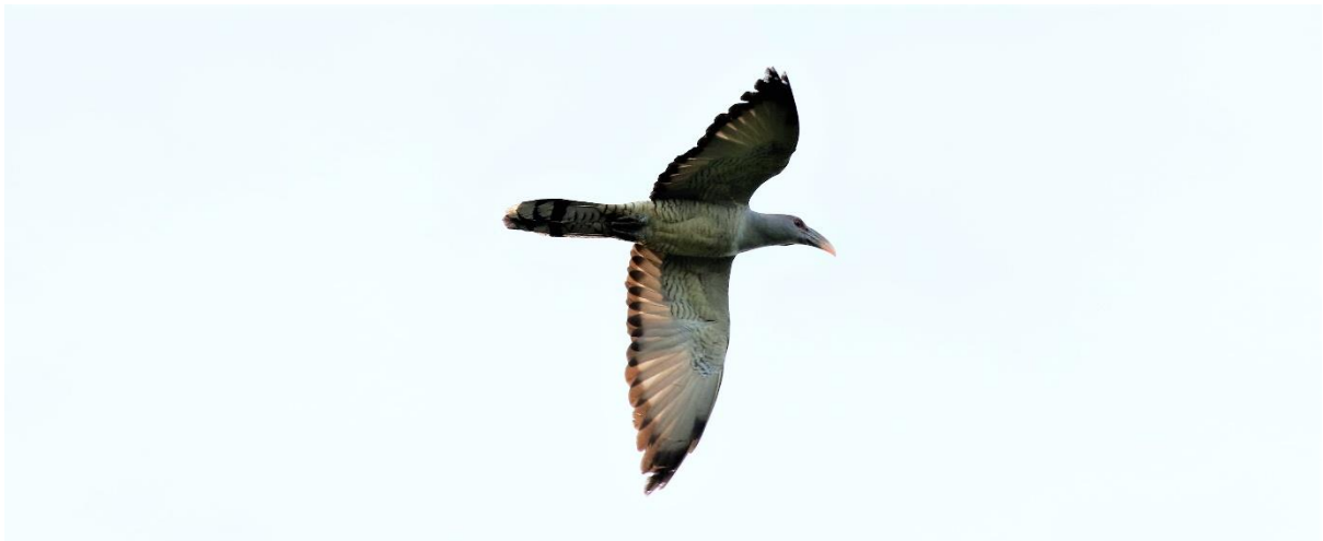
Above: Channel-billed Cuckoo (R.Baxter)

Everyone on trip three had previously seen the white-eye so we headed straight to Boigu Island. Our first morning was spent ashore where we had our first Collared Imperial-pigeons and Singing Starlings . Migrating Dollarbirds, Rufous Fantails, Pacific Swifts and Channel-billed Cuckoos kept us busy, while a few Uniform Swiftlets finished off the morning nicely.