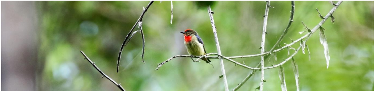
Above: Red-capped Flowerpecker

conduct their usual morning activities while migrating Dollarbirds, Rainbow Bee-eaters, Channel-billed Cuckoos and Pacific Swifts flew overhead on their yearly northward migration to PNG.